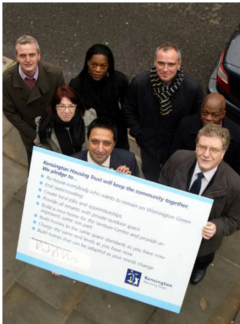
Kensington staff sign a pledge to the residents of Wornington Green

Kensington and Chelsea Council granted planning permission for the proposed regeneration of the Wornington Green estate in March. This was after more than four years of consultation, discussions, resident involvement and planning.